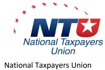
National Taxpayers Union