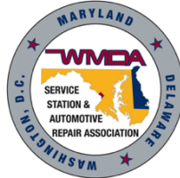
WMDA Service Station & Automotive Repair Association