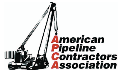
American Pipeline Contractors Association