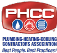
Plumbing-Heating-Cooling Contractors—National Association