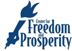
Center for Freedom and Prosperity