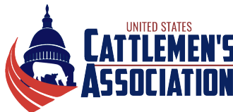
United States Cattlemen's Association