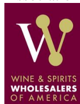
Wine & Spirits Wholesalers of America