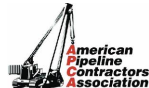
American Pipeline Contractors Association