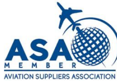
Aviation Suppliers Association