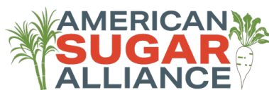
American Sugar Alliance