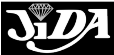
Jewelry Industry Distributors Association