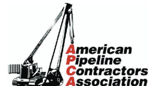
American Pipeline Contractors Association