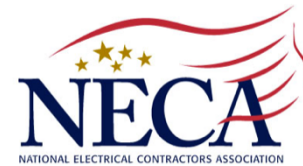
National Electrical Contractors Association