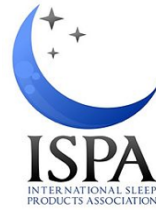
International Sleep Products Association