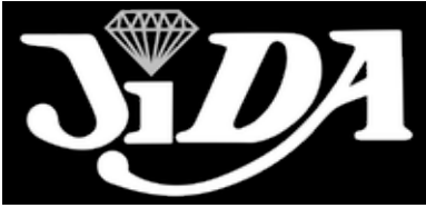
Jewelry Industry Distributors Association