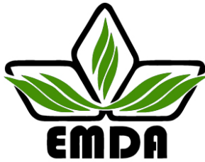
Equipment Marketing & Distribution Association