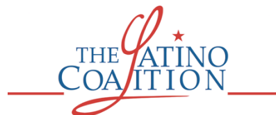
The Latino Coalition