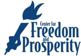
Center for Freedom and Prosperity