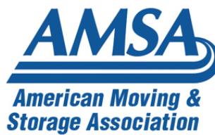
American Moving & Storage Association