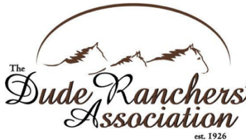
The Dude Ranchers' Association