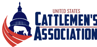
United States Cattlemen's Association