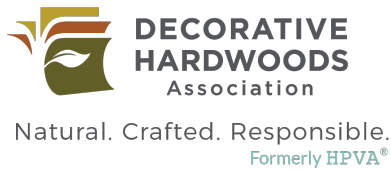
Decorative Hardwoods Association