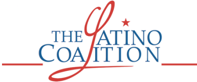
The Latino Coalition