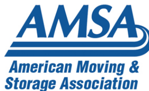
American Moving & Storage Association