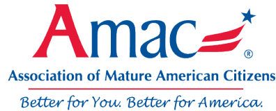
Association of Mature American Citizens