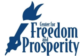
Center for Freedom and Prosperity