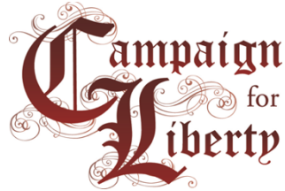
Campaign for Liberty