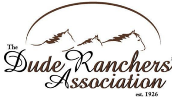
The Dude Ranchers' Association