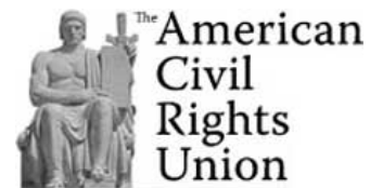
American Civil Rights Union