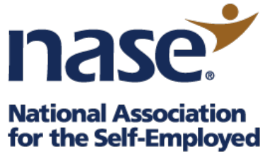
National Association for the Self-Employed