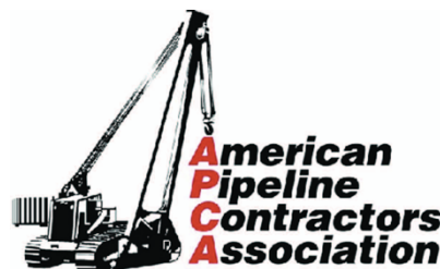
American Pipeline Contractors Association