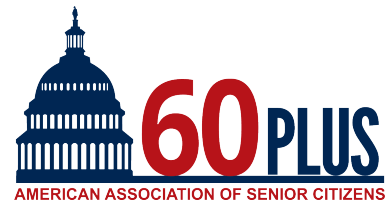
60 Plus Association