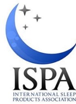
International Sleep Products Association