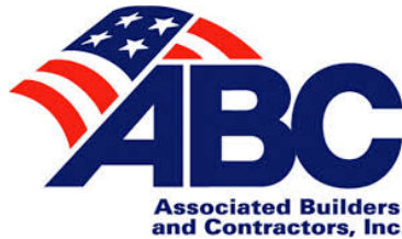
Associated Builders and Contractors, Inc.