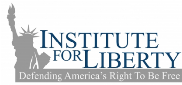
Institute For Liberty