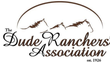
The Dude Ranchers' Association