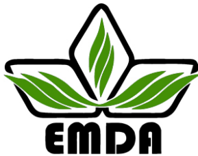
Equipment Marketing & Distribution Association