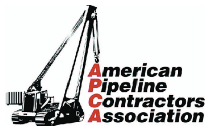
American Pipeline Contractors Association