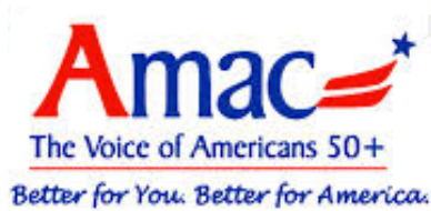
Association of Mature American Citizens