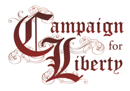
Campaign for Liberty