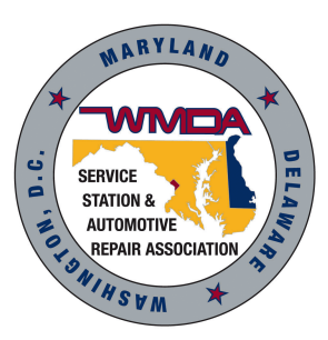
WADA Service Station & Automotive Repair Association